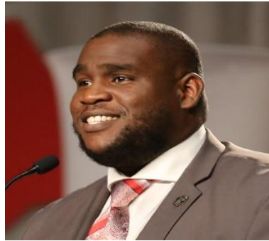
ITC -Gammon Theological Seminary